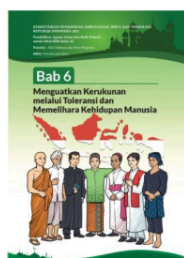
Figure. 3 Explicit Global Diversity Material

The value of the Pancasila student profile with global diversity is found in every chapter of the PAI textbook. The research findings from the three data sources show that each chapter in the PAI textbooks for grades 10, 11, and 12 contains material on this dimension. The value of this dimension encourages learners to appreciate noble cultures and be open-minded in interacting with different cultures so as to produce a tolerant attitude. Researchers' findings in this study show that the material content of this second dimension is spread across all chapters of PAI textbooks. The distribution of material on global diversity can be found explicitly and implicitly. Explicitly, the material on this dimension can be found, for example, in the PAI textbook of grade XI, chapter 6. This chapter discusses the material on Strengthening Harmony through Tolerance and Maintaining Human Survival. The content of this material can be an explicit example because it directly teaches the values of religious harmony by being able to coexist and help each other despite having different religious backgrounds. Attitudes of respect for differences in this case can be categorized as a form of integration of tolerance material content. This is in line with the view of 27 which reveals that tolerance can mean an attitude of respect for differences by not interfering in other people's affairs. The material in class XI chapter 6 as an explicit example can be seen as follows: