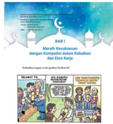
Figure. 7 Independent Material Explicitly

Apart from being found explicitly, this dimension of material can also be found implicitly in Islamic religious education and ethics books. One example of implicit self-reliance lessons can be found in the grade 11 textbook chapter 6 on Strengthening Harmony through Religious Tolerance and Safeguarding Human Life. While the chapter is about tolerance, it also includes a discussion about self-reliance and not giving others a hard time. Not inconveniencing others in this case can include self-reliance as it indicates a good understanding and self-regulation within the individual 37 . The grade 11 chapter 6 material, which is an implicit example of an independent dimension in this case, can be seen as follows: