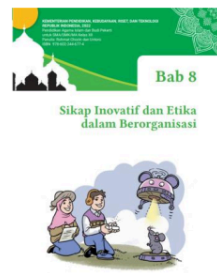
Figure 11 Creative Material Explicitly

In addition to explicitly, material on the value of critical thinking can also be found implicitly in each chapter in the PAI textbook. One example of creative material can be found in the grade 10 textbook chapter 10 on the role of ulama figures in the spread of Islam in Indonesia which discusses the da'wah methods carried out by the walisongo in Java. The guardians in Java in this chapter exemplify the attitude of creativity by using a variety of creative da'wah strategies such as poetry, gamelan, suluk, poetry, and so on 46 . In this chapter, students are invited to emulate the creative thinking of the walisongo as follows: