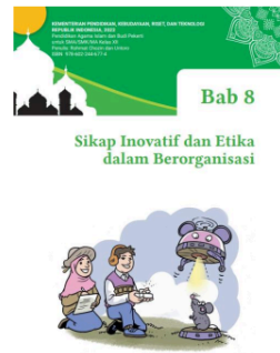
Figure. 5 Gotong Royong Material Explicitly

The research findings from the three data sources show that each chapter in the PAI textbooks for grades 10, 11, and 12 contains material on this dimension. The material on mutual cooperation is found in every chapter of PAI textbooks for grades 10, 11, and 12. This dimension encourages learners to be able to demonstrate an attitude of cooperation in everyday life. In this study, researchers found the content of this dimension scattered in various chapters of PAI textbooks. PAI textbooks integrate a lot of material that teaches learners to be able to do voluntary beneficial activities smoothly 32 . The content of this mutual cooperation material can be found explicitly or implicitly. Explicitly, the material of mutual cooperation can be found in the PAI textbook class XII chapter 8 which discusses innovative attitudes and organizational ethics as follows: