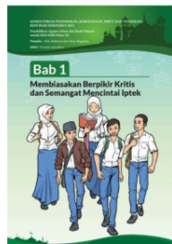
Figure. 9 Critical Reasoning Material Explicitly

The value of the Pancasila student profile in the critical reasoning dimension is found in every chapter of PAI textbooks for grades 10, 11, and 12. The research findings from the three data sources show that each chapter in the PAI textbooks for grades 10, 11, and 12 contains material on this dimension. The content of critical reasoning in PAI textbooks in various chapters can be found explicitly or implicitly. Explicitly, the material on the value of critical reasoning can be found in the PAI textbook for grade XI, chapter 1, which discusses getting used to critical thinking and the spirit of loving science and technology. The content of the material can be seen as follows: